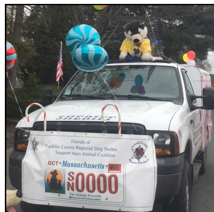
FCSO truck at Franklin County Spring Parade