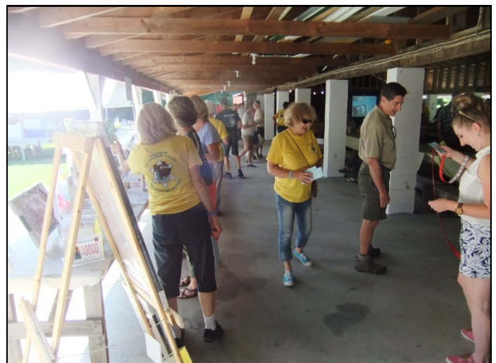
Mutts in Need Event