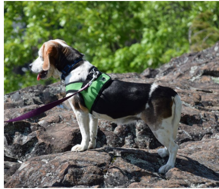
Fostered dog Sage

It is with great anticipation and excitement that we look forward to seeing