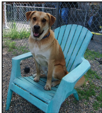
Shelter dog Hobbs is ready for his new home.

Last year we held a live auction as well as a raffle and we had some amazing items being auctioned off. We had oil paintings, framed sketches, and watercolors from local artists. We had a camping package worth over $400.00, and a garden basket of equal value. We had Wine and Chocolates as well as amazing baskets for the dogs and cats. We had items for the sports enthusiast. This year we expect to have even more incredible items in our live auction.