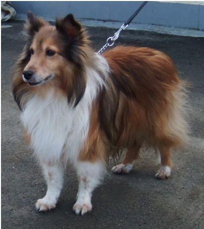
Fostered dog Molly

In the last four months, we have had 9 dogs enter foster homes for medical/