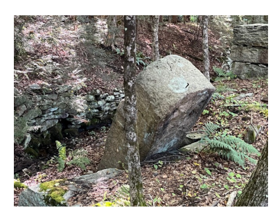
<u>Graves Ironworks – stone details</u>