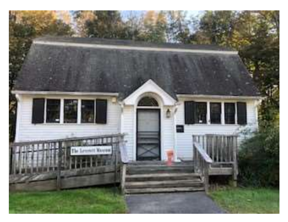
Front - North Side