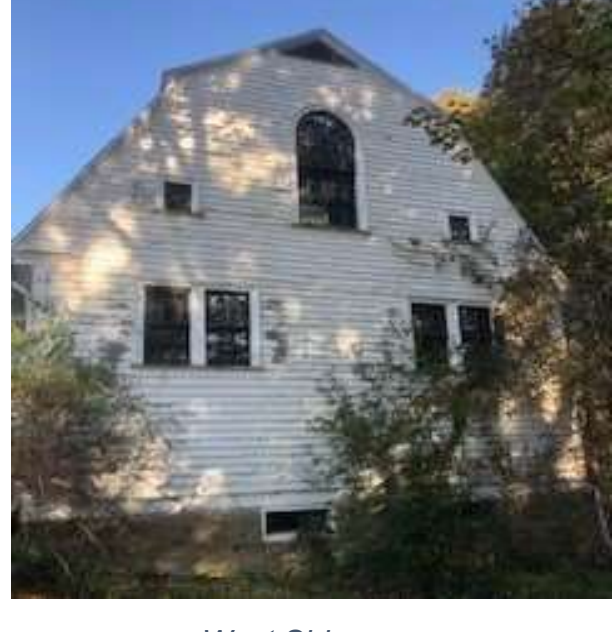
East Side West Side