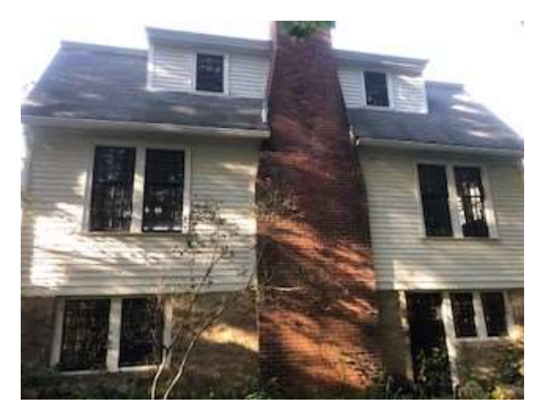
Back - South Side