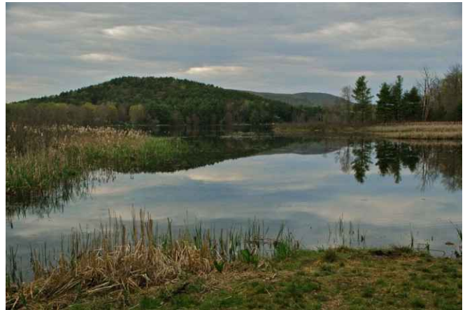
View of Leverett Pond (Rattlesnake Gutter Trust)

A successful Open Space and Recreation Program, under the primary stewardship of an Open Space Committee, can achieve all of the action steps listed below over time. However, it will be important to establish priorities for the first seven years. The Open Space Planning Committee has prioritized action steps by the goals and objectives listed in the previous chapter. These action steps are represented graphically (where possible) on the Seven-Year Action Plan Map and are outlined in greater detail in Table 9-1.